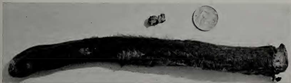
Fig. 8. Frontal graft of Jasio torn off by hand on April 5th, 1962; frontal graft of Jasio broken off on July 28th, 1962. For comparison a Polish 5 zł coin 29 mm in diameter is shown

Dziki cast his left, operated, single antler between April 26 and 27th, 1961, its weight was 150 g. In 1961 he set not only the left, operated antler with 3 points, but also